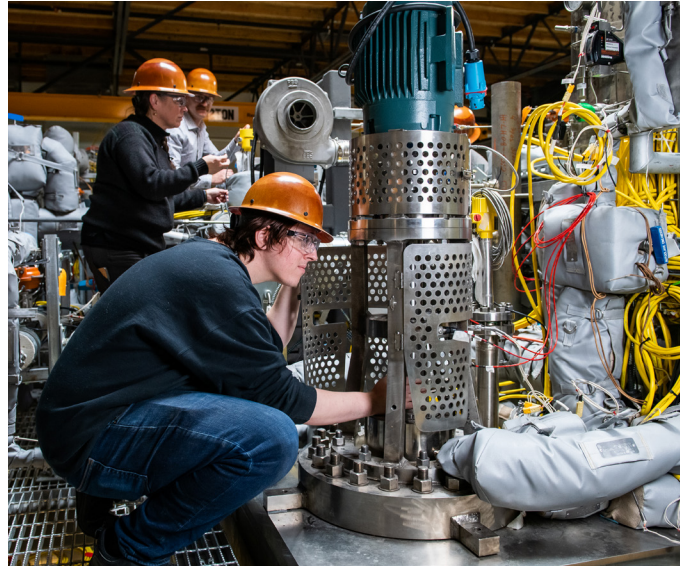
TerraPower engineers work on the Integrated Effects Test.

TerraPower's work focuses on a fast neutron spectrum, as opposed to the thermal neutron spectrum in which other salt reactors operate. The fast neutron spectrum minimizes the impact from fission contamination byproducts and allows the MCFR technology to avoid the need for the online reprocessing that is required