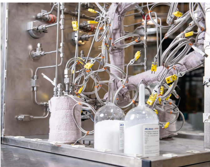
TerraPower rigorously tests molten salts through proprietary loops.

In December 2020, DOE selected the Molten Chloride Reactor Experiment (MCRE) proposal, with Southern Company as the prime, as a winner of the second Advanced Reactor Demonstration Program risk-reduction pathway. MCRE is relevant to TerraPower's MCFR design.